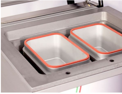
Interchangeable sealing die