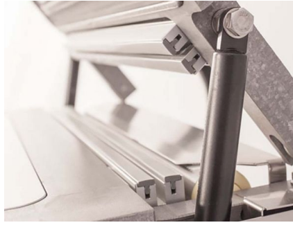
Film Cutting Blade (MAP MODE)