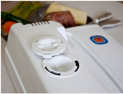
Technology of the future