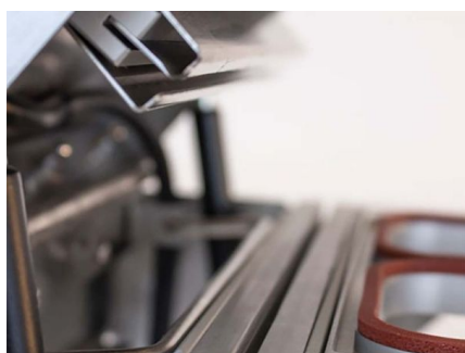
Film Cutting Blade