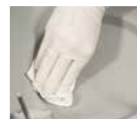
Always perfect chamber cleaning