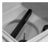
Removable sealing bar without tools