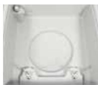
Ultra-resistant vacuum chamber